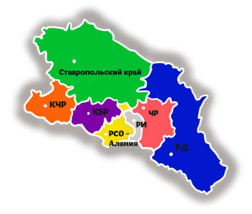
picture 1 Map of the North Caucasus Federal District North Caucasus Federal District (NCFD)